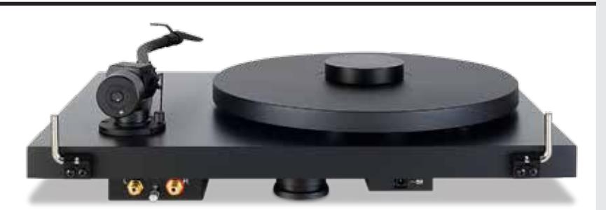
ABOVE: Stereo RCA sockets are mounted under the left of the plinth, PSU input to the right. Three machined feet screw into place for levelling and vibration control

and the horns in 'Das Tanzlied' appearing rich and distinct – while the soft dynamics displayed at the end of 'Das Nachwanderlied' were treated with respect.